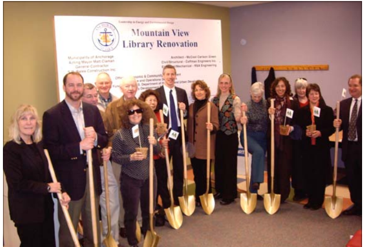
Representatives from the Municipality, Assembly, major donors and the Native village of Eklutna gather for the ceremonial groundbreaking of the new Mountain View Branch Library building March 2.

Mountain View residents have been working to restore a library to the neighborhood since the original branch closed in 1988. The new branch will utilize green building design (on target for LEED Gold Level green building certification)