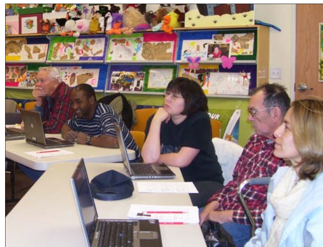
Muldoon Branch conducts computer classes on laptops.

The laptops can be used anywhere in the library. The computers have wireless Internet access, DVD/CD player capability (bring your own ear buds), some games, word processing and other standard office software. Patrons need a flash drive (thumb drive) to save material. Also—there is no printing capability directly from the laptop computers. Staff at Muldoon is taking advantage of the laptops to offer some introductory computer classes.