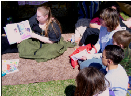
Reading Rendezvous 2008 — After registering for the Summer Reading Program (top photo) hundreds of Anchorage kids and their parents spread out across the lawn at Lousac to try individual and group activities.

Reading Rendezvous started in 2001, as the summer reading program finale. In 2002, organizers moved the event to the beginning of summer to emphasize research showing that children who continue to read during summer vacation perform better in the fall when school resumes. One of the goals of the Reading Rendezvous is to show that reading is a fun activity that