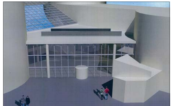
Prop 5 funds will be used to remove Loussac’s stairs and terrace, and move the entrance moved to ground level. Design drawing courtesy USKH Inc.

Proposition 5, the Public Facility Capital Improvements Bond, on the April 7 Municipal ballot, will provide funds in the amount of $1.5M to renovate the entrance and create an